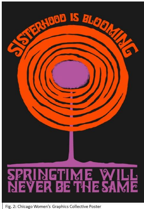
Fig. 2: Chicago Women's Graphics Collective Poster

The founders of the Graphics Collective wanted their new feminist art to be a collective process in order to set it apart from the male-dominated Western art culture. 15